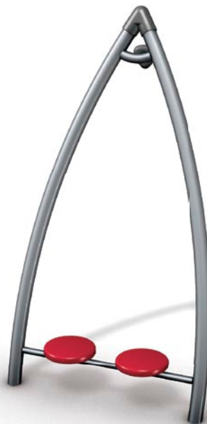
Social Discs #26072 Critical Fall Height: 4' (1.2m)