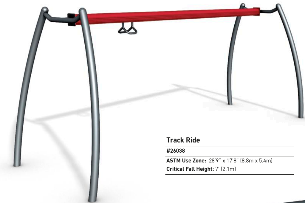
Track Ride #26038 ASTM Use Zone: 28'9" x 17'8" (8.8m x 5.4m) Critical Fall Height: 7' (2.1m)