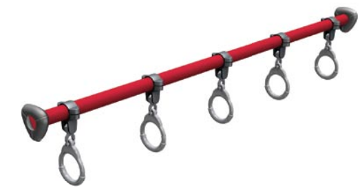
Trapeze Ring #26082 Critical Fall Height: 8' (2.4m)