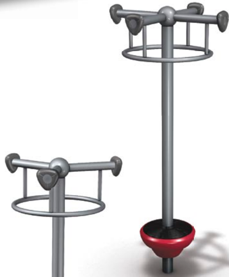
X-Pod Steps #26059 4 way #26058 3 way #26057 2 way Critical Fall Height: 8' (2.4m)