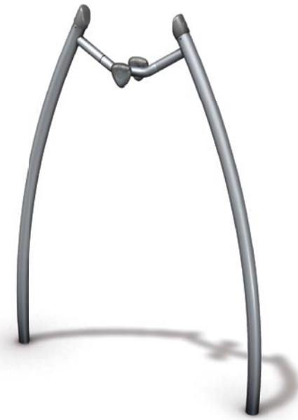
Upright 2-Way Link #26102