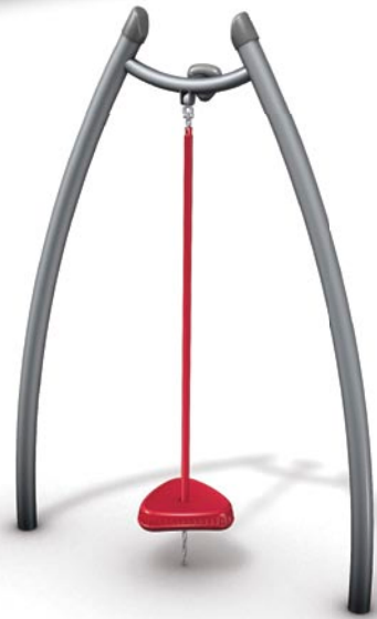
Suspended Pod #26074 Critical Fall Height: 4' (1.2m)