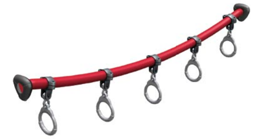
Inverted Trapeze Ring #26085 Critical Fall Height: 8' (2.4m)