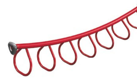
Inverted Loop Ladder #26079 Critical Fall Height: 8' (2.4m)