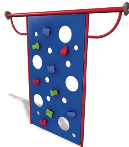
Rock Wall Link #26099 Critical Fall Height: 8' (2.4m)