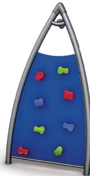
Rock Climbing Wall #26069 Critical Fall Height: 8' (2.4m)