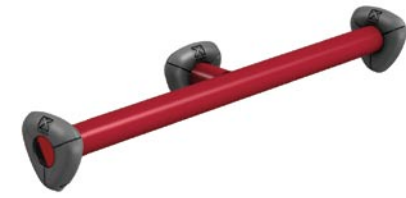
Single Link Cross Beam #26091