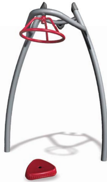
Twister #26076 Critical Fall Height: 8' (2.4m)