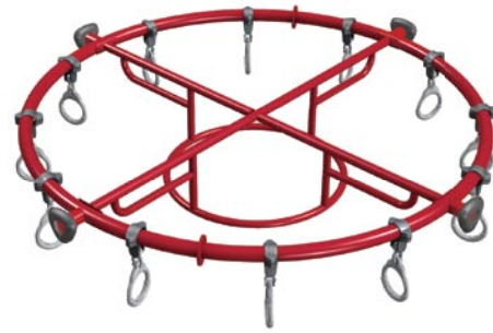
Trapeze Quad Circuit #26062 Critical Fall Height: 8' (2.4m)