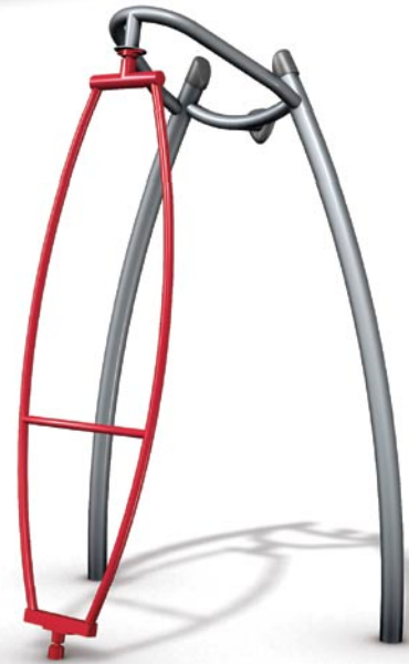
GT Xcelerator ® #26077 Critical Fall Height: 4' (1.2m)