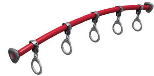
Arched Trapeze Ring #26084 Critical Fall Height: 8' (2.4m)