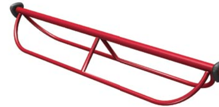
Tri Ladder #26088 Critical Fall Height: 8' (2.4m)