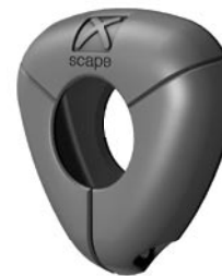
Triangular Shroud #26094