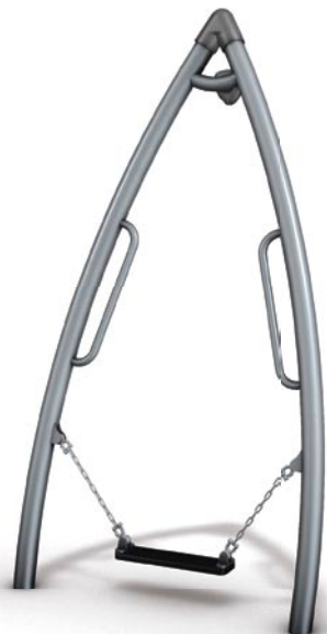
Swivel Meister #26075 Critical Fall Height: 4' (1.2m)