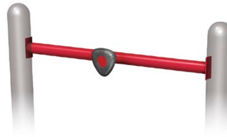
Single Link Cross Beam #26092 PowerScope #26093 PrimeTime