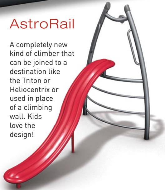
AstroRail® #26089 Critical Fall Height: 8' (2.4m)

A completely new kind of climber that can be joined to a destination like the Triton or Heliocentrix or used in place of a climbing wall. Kids love the design!