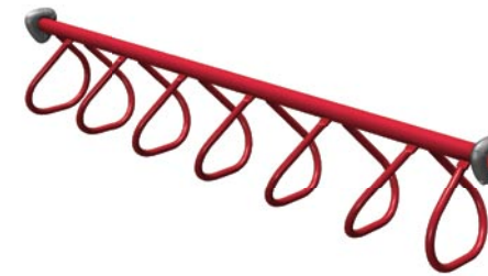
Stretched Loop Ladder #26080 Critical Fall Height: 8' (2.4m)