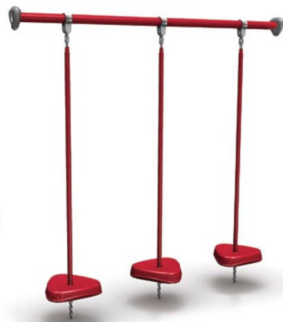
Hanging Pod Link #26095 Critical Fall Height: 4' (1.2m)