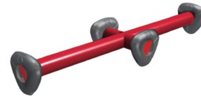
Double Link Cross Beam #26090