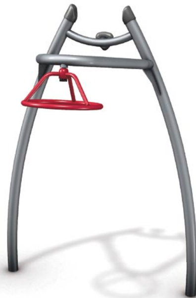
Single Sky Wheel #26073 Critical Fall Height: 8' (2.4m)