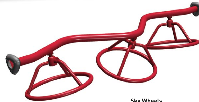
Sky Wheels #26081 Critical Fall Height: 8' (2.4m)