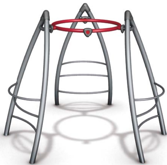
Hangout Circuit #26100 Critical Fall Height: 8' (2.4m)