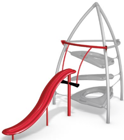
AstroRail® Destination Attachment #26060 AstroRail For Triton (shown) #26097 AstroRail for Heliocentrix Critical Fall Height: 8' (2.4m)