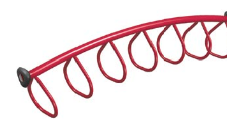
Arched Loop Ladder #26078 Critical Fall Height: 8' (2.4m)