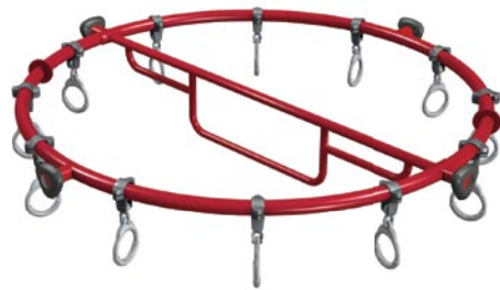
Trapeze Dual Circuit #26061 Critical Fall Height: 8' (2.4m)